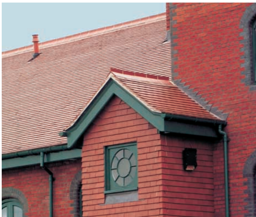
Left: Plum red tiles for the roof and vertical were specified for the re-roofing of Clementsby, Brickendon on a listed stud farm built in 1902. Crested ridges and finials were made to order to match the originals.