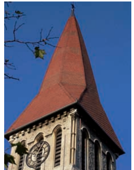
Above: St John The Evangelist Church Dulwich, Plum Red with bands of Country Brown Tiles in a mix of Club and Fishtail Ornamental Tiles, together with purpose-made hips.