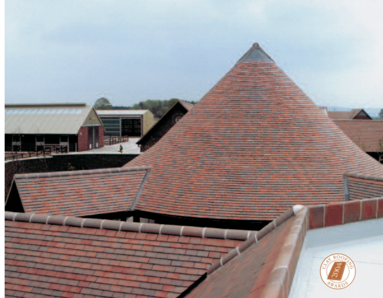
Above: The RSPCA Educational Building Dorrington, Nr Shrewsbury. This unusual Roof in Brown Antique Smoothfaced tiles was highly commended at Clay Roofing Awards 2004