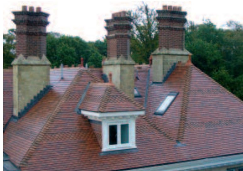
Left: Brown Antique tiles give a traditional appearance to the redevelopment of Shanklin Manor, IOW. Ornamental detailing has been restored with the use of bands of club tiles, bonnet hips and ornamental finials.

A traditional natural mixture of rich red, brown and blue multi-coloured tiles that adds character to any building. These varied colours are produced by skilled control of the burning process and cannot be reproduced by artificial means.