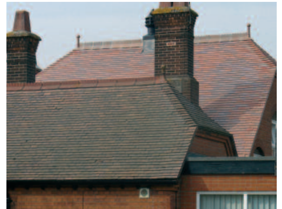
Right: Brown Antique Smoothfaced tiles were found to provide a like for like match to the originals on this reroofing project at Mylands School in Essex.