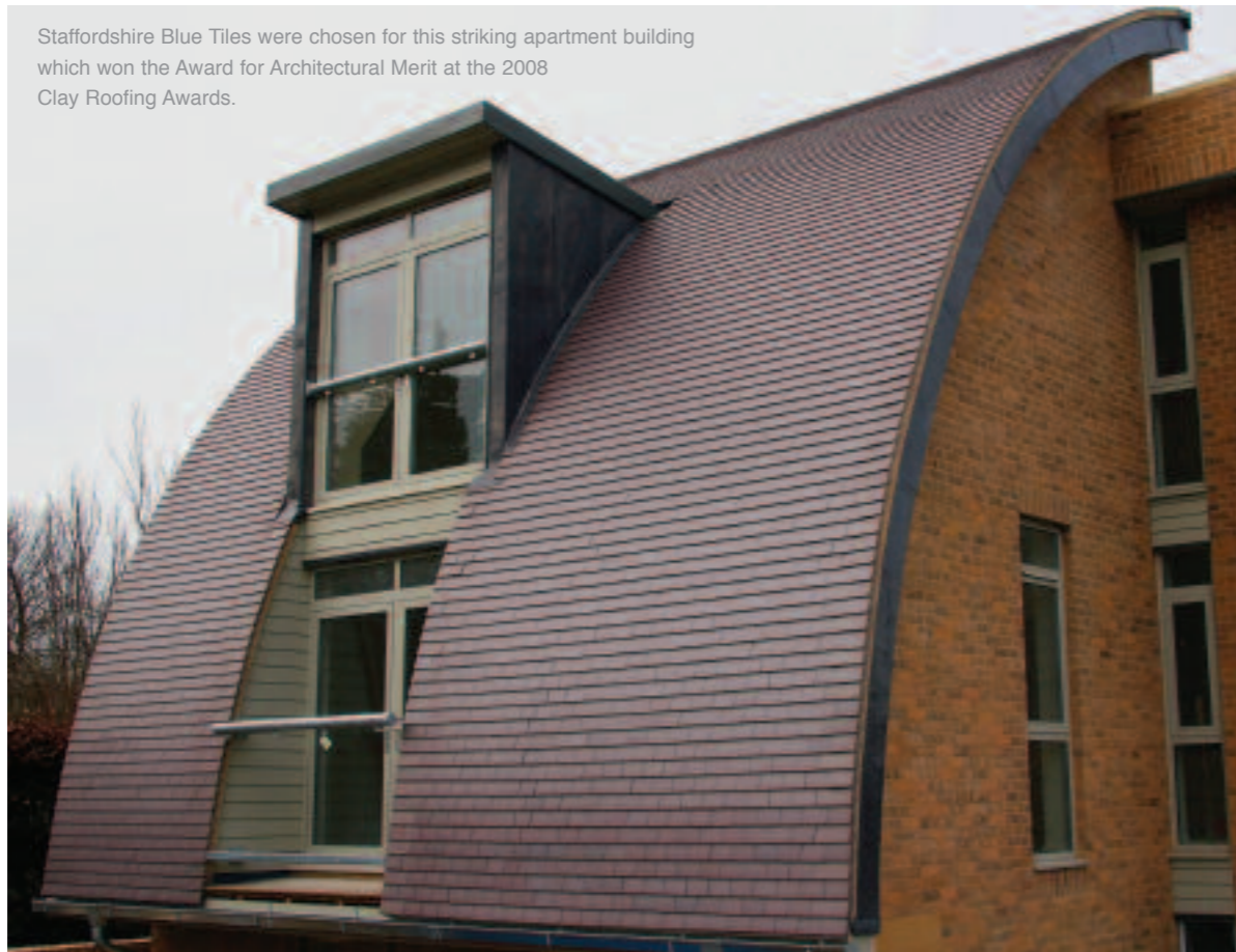
Staffordshire Blue Tiles were chosen for this striking apartment building which won the Award for Architectural Merit at the 2008 Clay Roofing Awards.