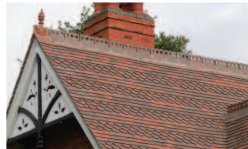
Above: This Victorian House was re-roofed using a mixture of Brown Brindle and Country Brown Tiles with Ornamental Club Tiles to match the original. Ornamental finials and ridge tiles were hand-made to match the original.