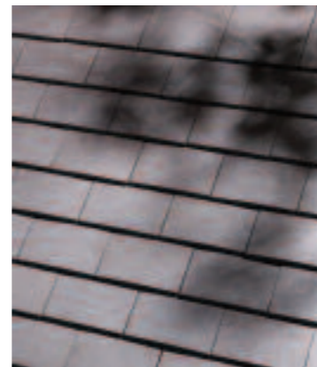
Left: Staffordshire Blue tiles on a private house in Poole. This self build property won Best Self Build at Clay Roofing Awards 2006