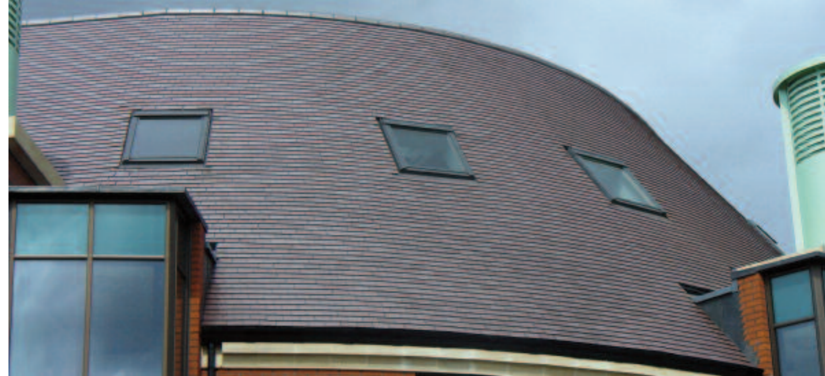
Above: This striking Library building in Swindon demonstrates the use of Staffordshire Blue tiles, a traditional product, in a contemporary design.