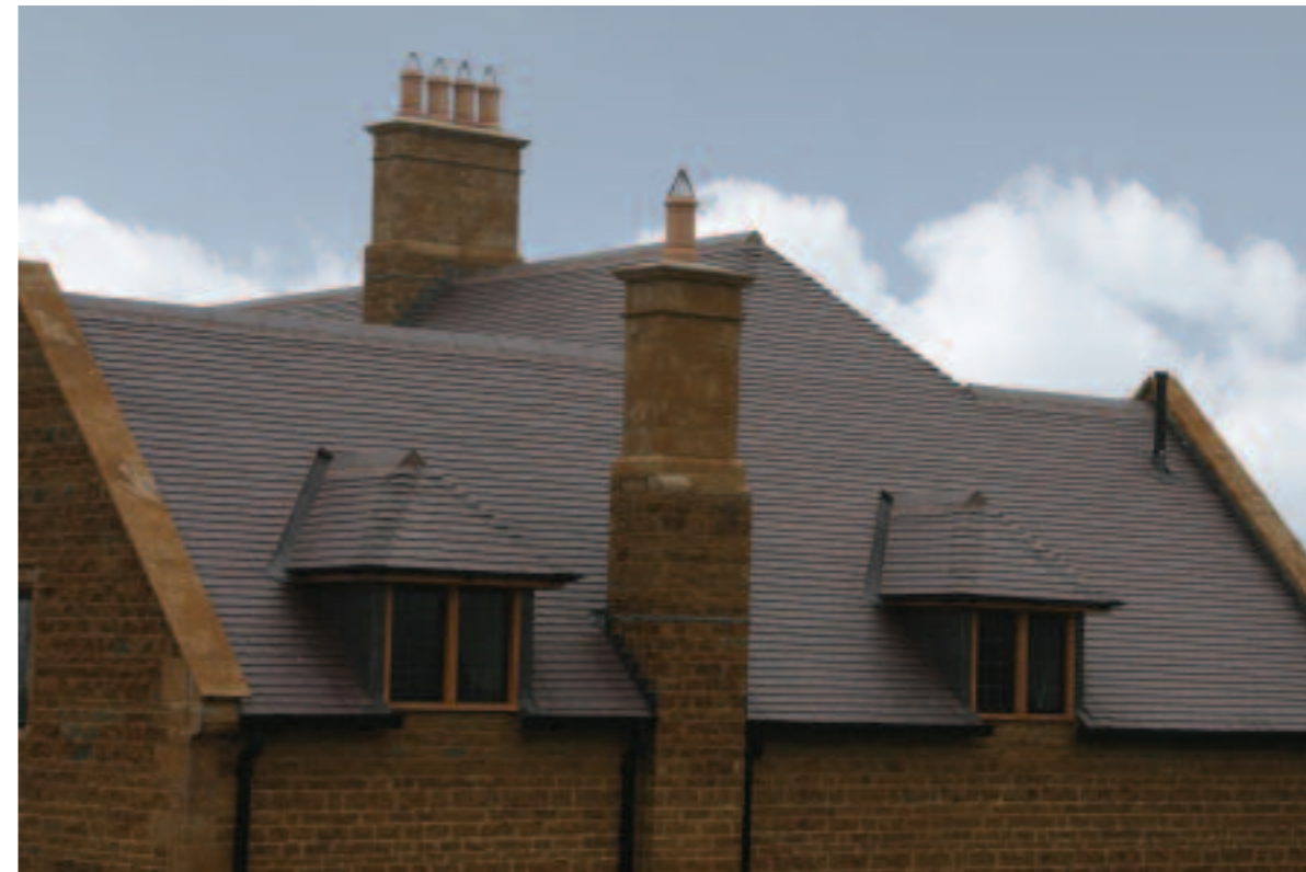
Left: This impressive self build uses Staffordshire Blue tiles as an alternative to slate.