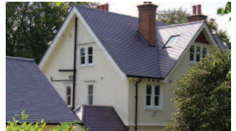
Right: Staffordshire Blue tiles on a reroofing project at Croxley Heath in Hertfordshire