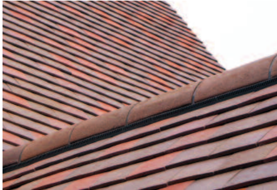
Above: A Dry Fix Ridge Vent on a private house in Dover

Modern roof insulation and the use of domestic appliances has created a need to remove the increased water vapour from the roof space. Many ventilation fittings designed for this purpose have seriously impaired the aesthetic qualities of the roof. We offer a system that uses clay clad ventilation components that not only match the tiles but also lie flush with the tiling or ridge line.