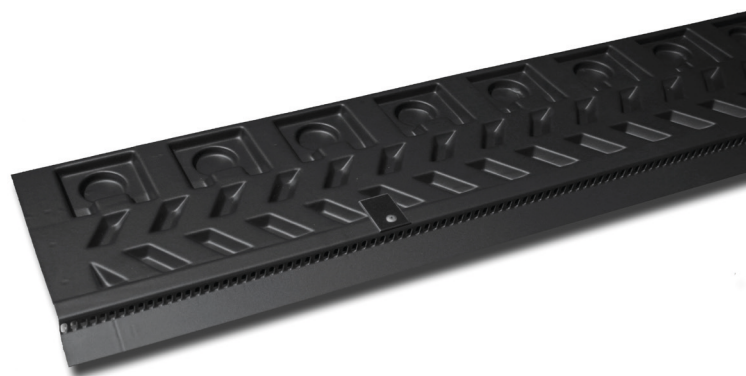
FLAT TO PITCHED ROOF JUNCTION

Specification clause: Install Tileline Abutment vent supplied by Dreadnought Tiles, Pensnett, Brierley Hill West Midlands Tel: 01384 78361 Fax: 01384 74553 E: sales@dreadnought-tiles.co.uk under suitable flashing to provide ventilation to the roof-space equivalent to 5000mm 2 /m in accordance with Building Regulations and BS 5250. Install continuously as shown on Dreadnought Tiles instructions